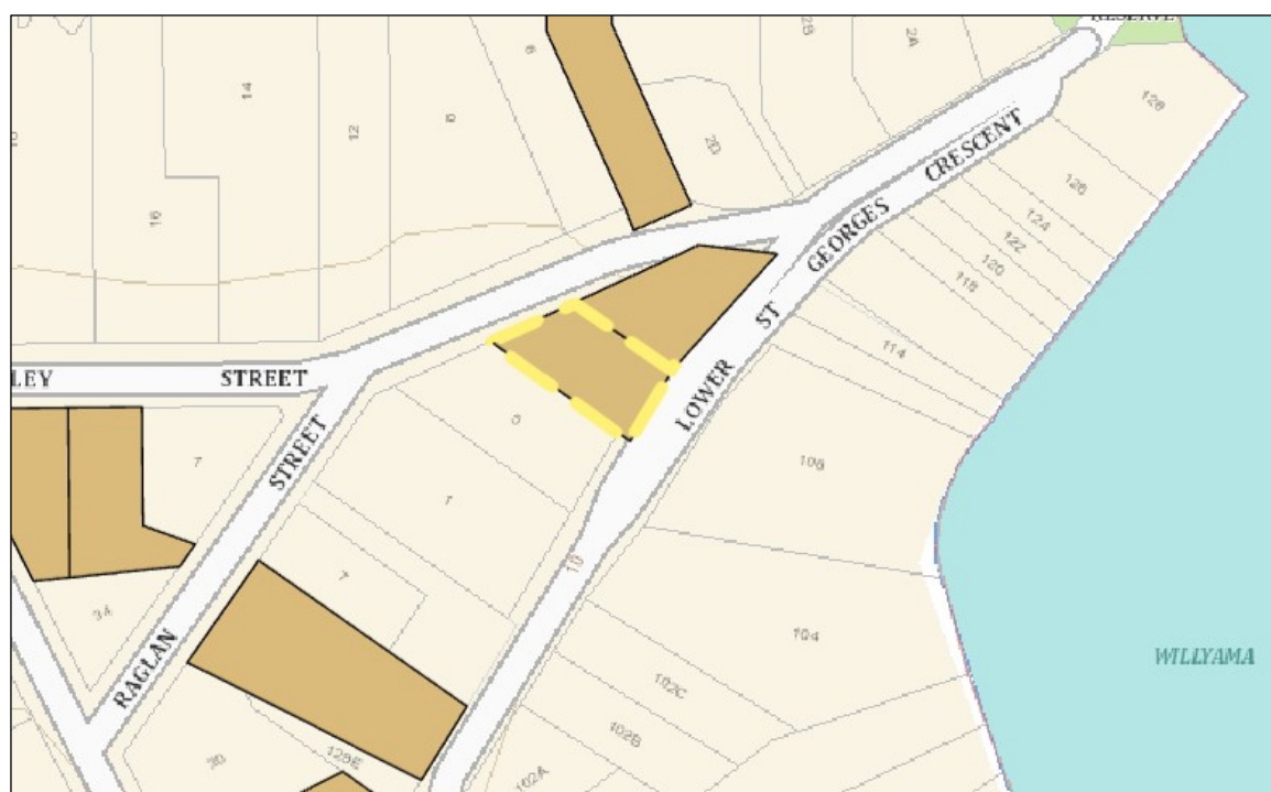
Figure 13: Existing CBLEP 2013 Heritage Map