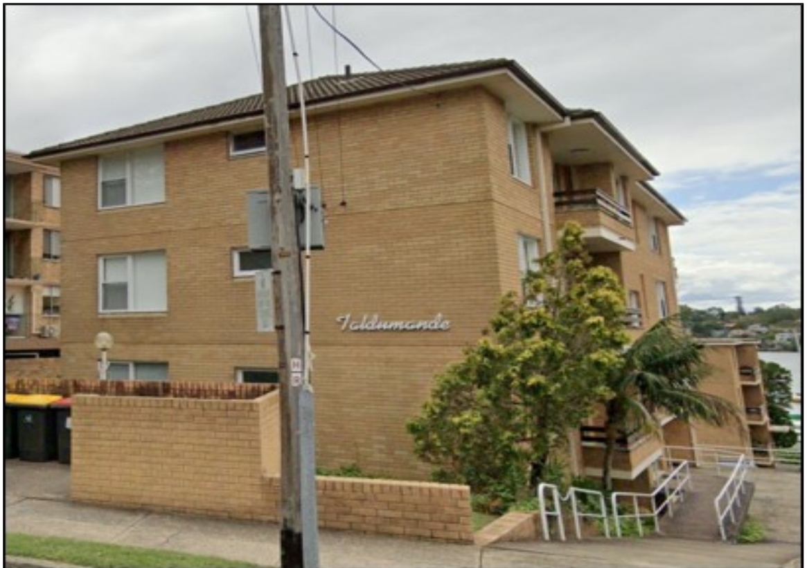
Figure 10: No. 12 Wolseley Street, a 3 residential flat building to the northwest of the subject site.