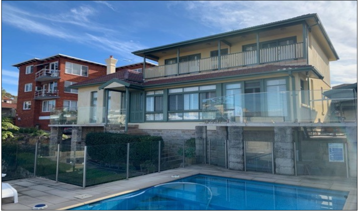
Figure 5: Rear of the site showing the rear wing.