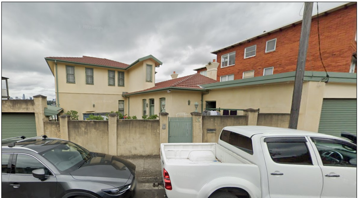
Figure 4: Front of the subject site as viewed from Wolseley Street.