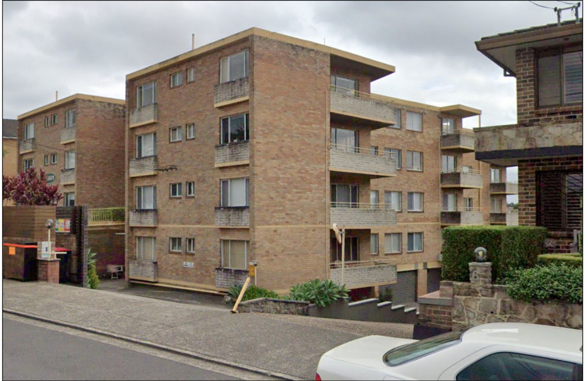
Figure 11: 6 Wolseley Street, 4 storey residential flat building located across the road.