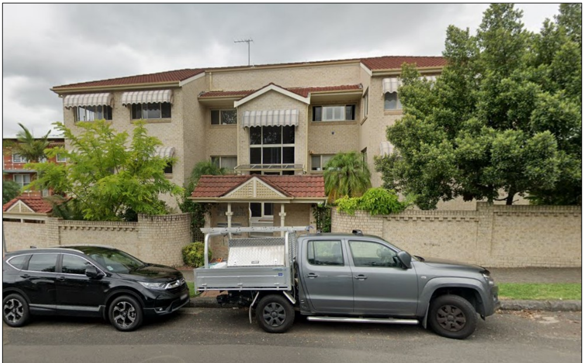
Figure 12: 5 Raglan Street, a 3 storey residential flat building located further east of the site.