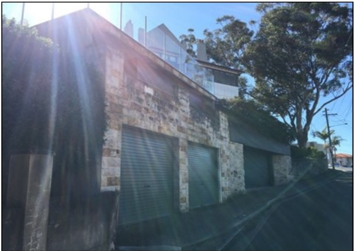
Figure 6: Rear garages on St Georges Crescent.