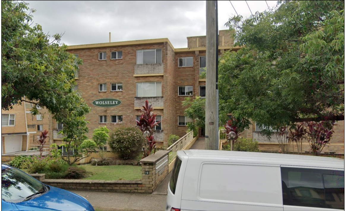
Figure 9: 10 Wolseley Street, a 3 storey residential flat building located directly across from the subject site.