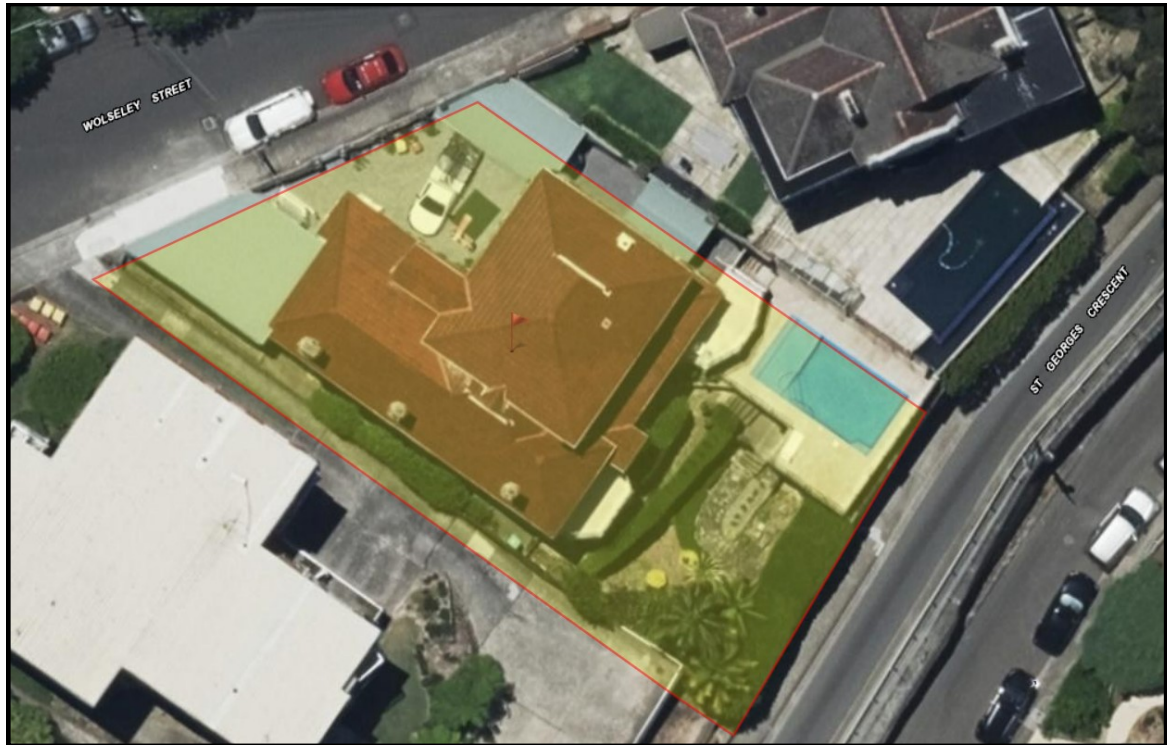
Figure 3: The subject site (SIX Maps).