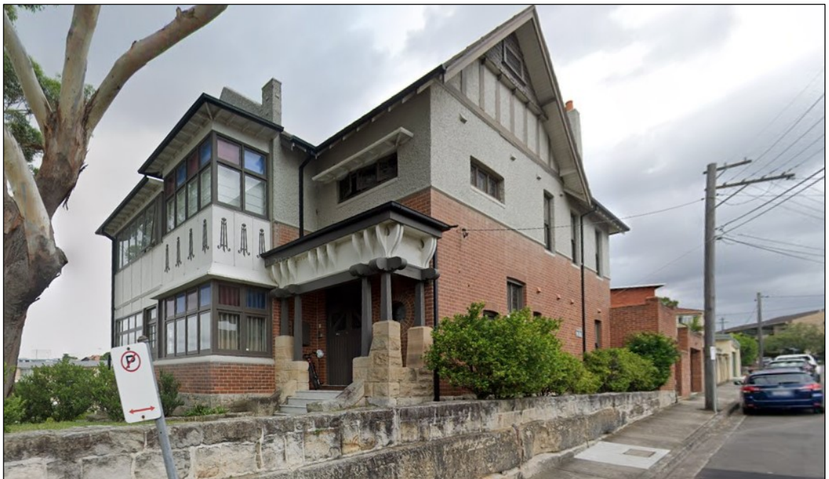
Figure 8: 1 Wolseley Street, a 2 storey dwelling house located to the east of the site.