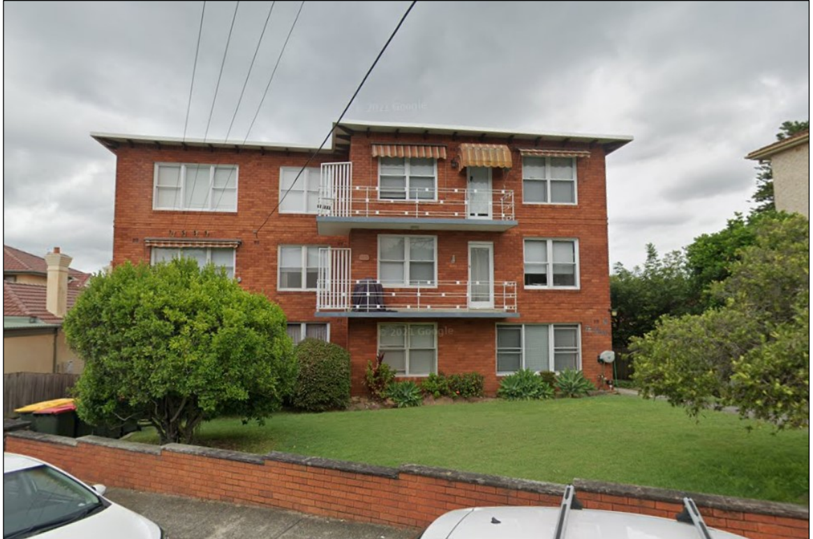
Figure 7: 5 Wolseley Street, a 3 storey residential flat building which neighbours the subject site to the south.